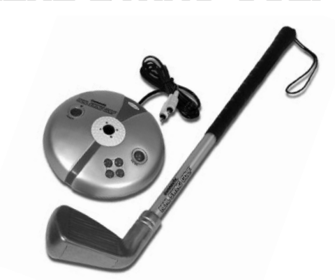
I9037 For 1 to 4 players / Ages 8 and up INSTRUCTION MANUAL P/N 82396410 Rev.D